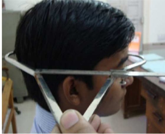
Figure: Method of measuring Head length