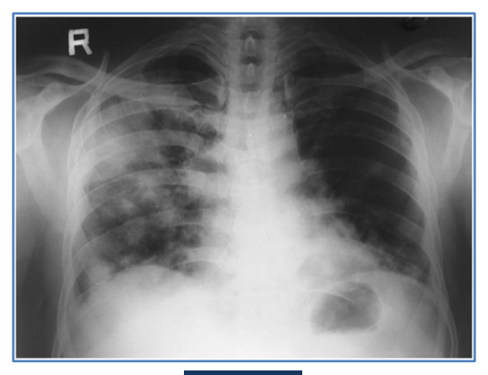
Fig. 1: X-ray chest showing right upper lobe mass like opacity and nodular lesions in mid and lower zones.