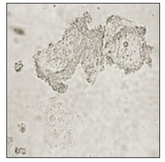
Fig. 1: Wet Mount showing 'Clue Cell'

P-values in bold are statistically significant (p<0.05).