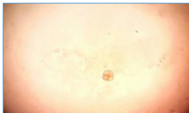
Fig. 2: KOH Finding showing Presence of Sclerotic Body (40x Magnification).

Financial or Other, Competing Interest: None.