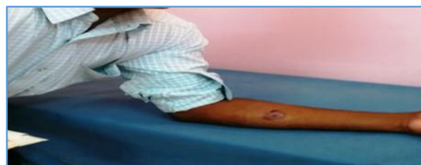
Fig. 1: Showing the Nodular Lesion on the Left Forearm of the Patient.

Pigmented sclerotic bodies noted in 10% KOH mount (Fig. 2); histopathological examination showed presence of sclerotic bodies and microabscess (Fig. 3). Culture on Sabouraud Dextrose Agar with chloramphenicol showed fungal colony, and subsequent slide microculture proved the identity to be Fonsecaea pedrosoi (Fig. 4) by the display of characteristic septate hyphae, shield conidia and chains of conidiation. The patient was treated with Itraconazole (200-400 g) daily and Terbinafine (500-1000 g) daily for 6-12 months and showed signs of improvement.