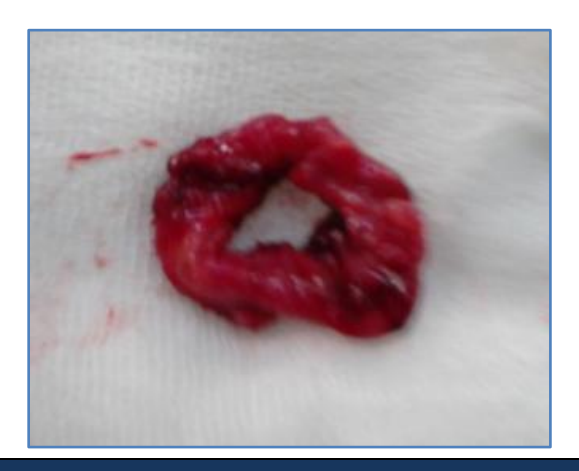
Fig. 4: Showing Doughnut of haemorrhoids