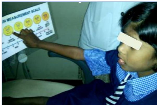
Figure 3: Visual Analogue Scale

Figure 3: A 8year old girl Showing her Pain Experience on Visual Analogue Scale.