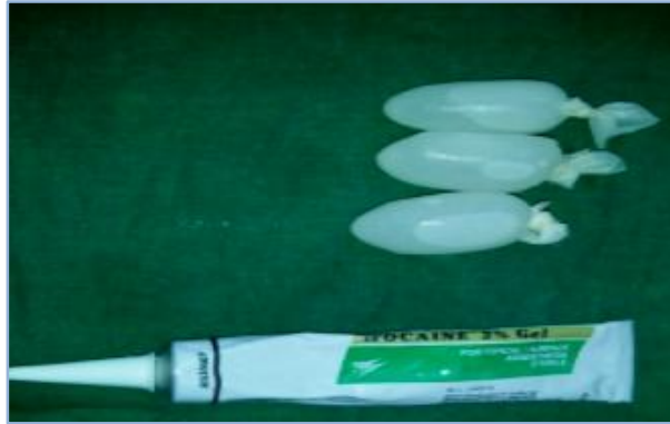
Figure 1: Ice Cubes and Local Anesthetic Gel