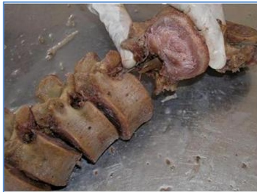
Fig. 1: Showing Sample selection