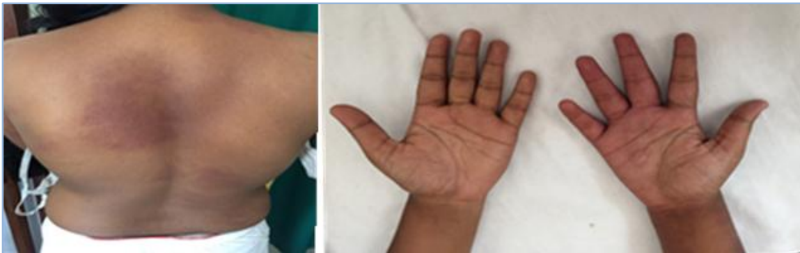
Fig. 2: The patient has angioma of both upper and lower limbs and back Asymmetry of development of upper limbs and hand is seen

There was facial asymmetry and disparity in the growth of the upper limbs and hand development. She has generalised tonic-clonic seizures since the age of 12 years. The epilepsy is becoming more intractable and difficult to manage. The patient is on antiepileptic treatment with Levetiracetam 1000mg/day, Valproic Acid 1500mg/day and Clonazepam 2mg/day. Neurologist's