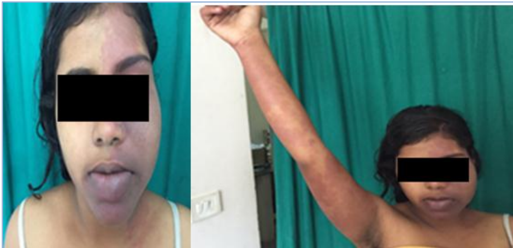
Fig. 1: The patient has facial angiomas and facial asymmetry

Case Report: A female patient aged 18 years old presented with a facial angioma localised in the Trigeminal nerve region on the left side of the face present since the age of 4 years. She had angiomas in the face, upper and lower limbs and the back.