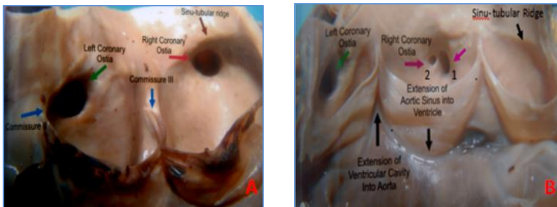
Fig. 1: Showing coronary ostia, its relation to sinu- tubular ridge, to upper margin of cusp & to the commissure.

In the present study height of coronary ostia was measured from nadir [Table VI]. Cavalcanti et al. (2003). 19 mentioned that mean height of right coronary ostia was 13.2+/-2.64 mm. and that of Left coronary ostia was 12.6+/-2.61 mm. Joshi et al. (2010). 5 reported that the height of Right coronary ostia was 14.08 mm and that of Left coronary ostia was 13.3 mm. hence the height of Right coronary ostia was at a higher level as reported by Cavalcanti et al. (2003). 19 and Joshi et al. (2010). 5 In the present series the height of Left coronary ostia was at higher level (15.65 mm). Some of the variations that have been observed between the present findings and that of other workers in the field as reviewed in the literature may be correlated with size and weight of the heart and the embryonic development. In the present work no openings were found in pulmonary artery or the non-coronary sinus. Bhimali et al. (2006). 17 and Joshi et al. (2010). 5 reported similar findings.