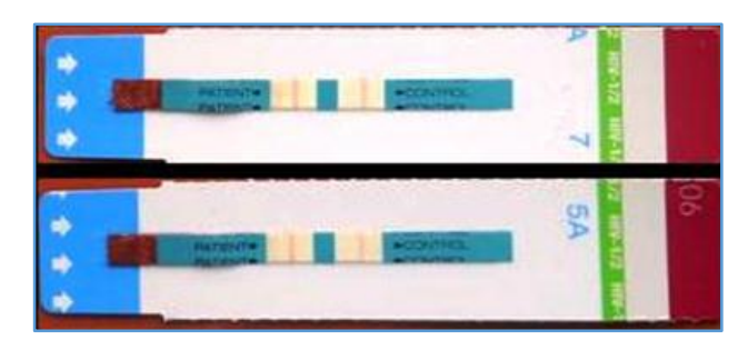
Fig. 2: HIV-1 Positive using Alere Determine™ HIV-1/2