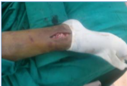
Fig 5. Tension band wiring