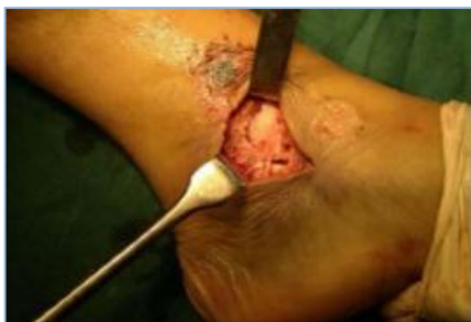
Fig 7. Exposure of fracture site