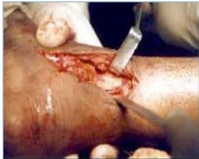
Fig 3. Exposure of the fracture site