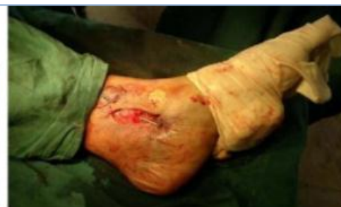
Fig 8. Fixation with CC screws