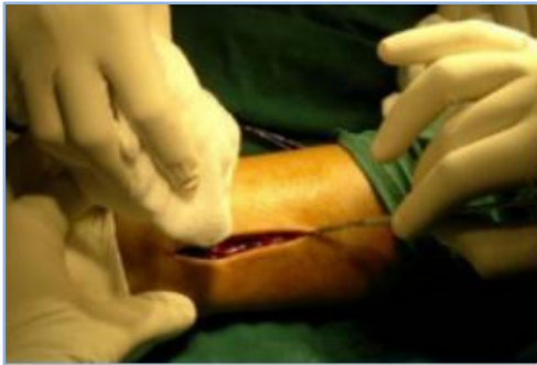
Fig. 1: Incision for lateral malleolus