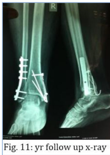
Fig. 11: yr follow up x-ray

CONCLUSION: In or present study of 20 patients with ankle fractures that were unstable, displaced or both treated surgically by Open reduction and internal fixation in accordance with AO principles. Understanding the mechanism of injury is essential for good reduction and internal fixation. The bend of the lateral malleolus should be reproduced when the plate is being used and also the fibular length has to be maintained for lateral stability of the ankle. Anatomical reduction is essential in all intra articular fractures more so for a weight bearing joint like ankle. Open reduction and internal fixation will ensure high standard of reduction besides eliminating the chances of loss of reduction since the operative results were satisfactory in 90% of patients.