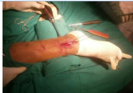
Fig 4. Fixed with 2 k-wires