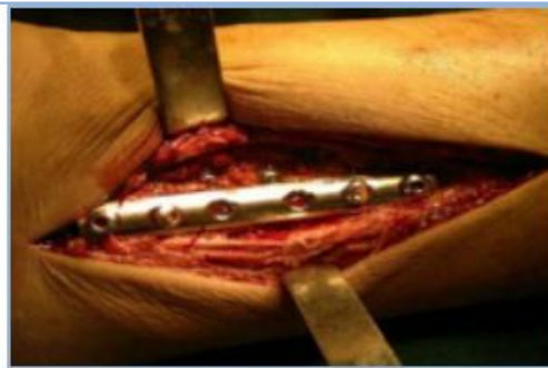
Fig. 2: ORIF with semi-tubular plate