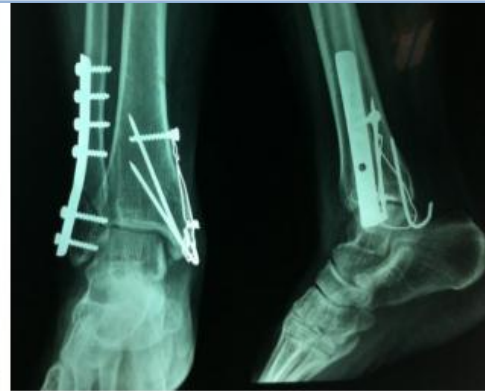
Fig 10. 4 weeks postoperative xray