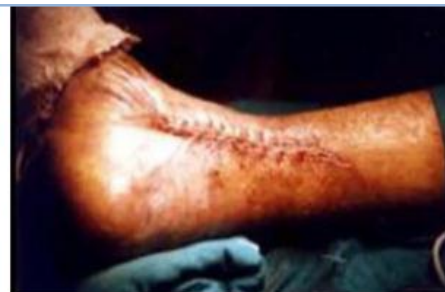
Fig 6. Skin closure