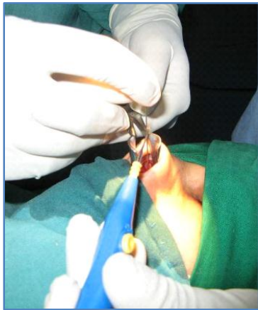
Fig. 1: Intra operative photo of submucosal diathermy procedure