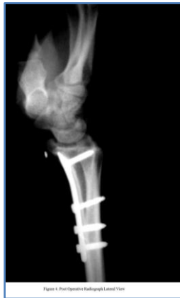
Fig. 4: Post operative Radiograph Lateral View