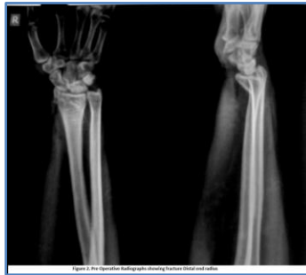
Fig. 2: Pre operative Radiograph showing fracture distal radius