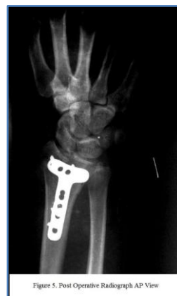
Fig. 5: Post operative Radiograph AP View