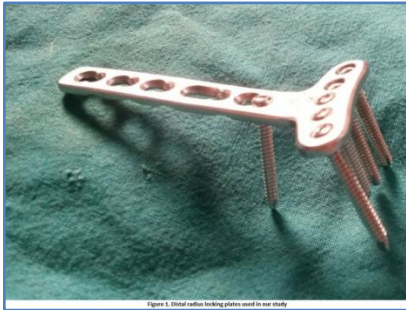
Fig. 1: Distal radius locking Plates used in our study

distal radial fractures in patients sixty-five years of age and older, J Bone Joint Surg Am 2011;93 (23): 2146-2153.