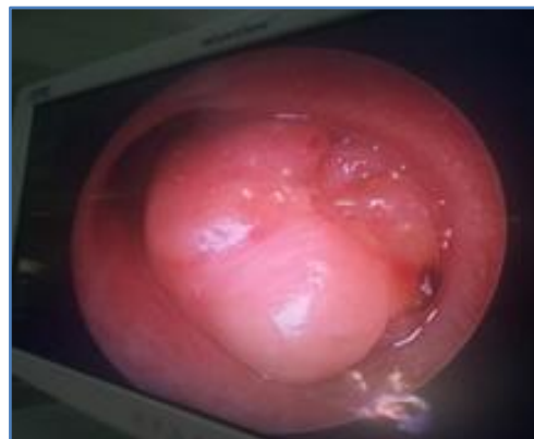
Fig. 4: Tumour as viewed through telescope