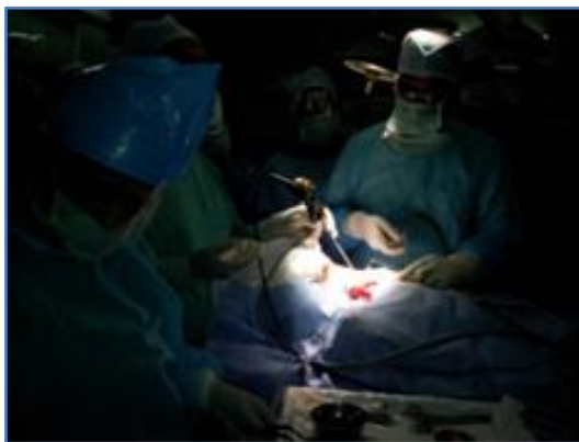
Fig. 3: Instrumentation through tracheotomy

Bilateral air entry was present, air entry of the right lung improved dramatically. Post-operative vitals were normal.