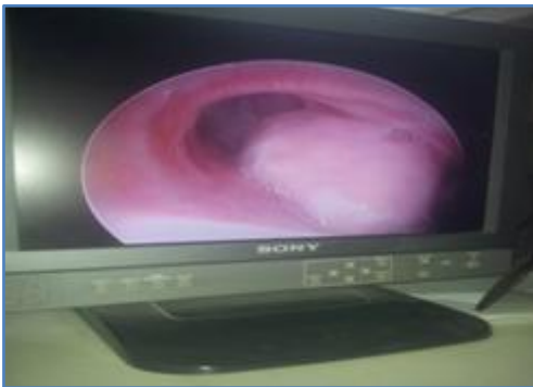
Fig. 1: Tumour during evaluation through

Telescopic finding revealed proliferating growth (figure 1) firm in consistency arising from the anterior wall of the carina extending into the right main bronchus blocking the right main bronchus completely, the opening to the left main bronchus was free and clearly visible. Biopsy was taken and sent for histopathology. Adrenaline was applied and hemostasis was secured. Vitals were stable throughout the procedure. Patient was reversed with Neostigmine 2.5mgs and Glycopyrrolate 0.4mg. Recovery was smooth and uneventful. Four days later report of HPE revealed benign spindle cells lesion – fibro inflammatory reaction.-a benign tumor.