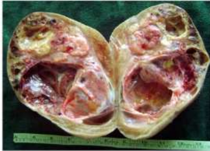
Fig 1: Multiple variable sized cysts and nodules of solid area with hemorrhage and necrosis.