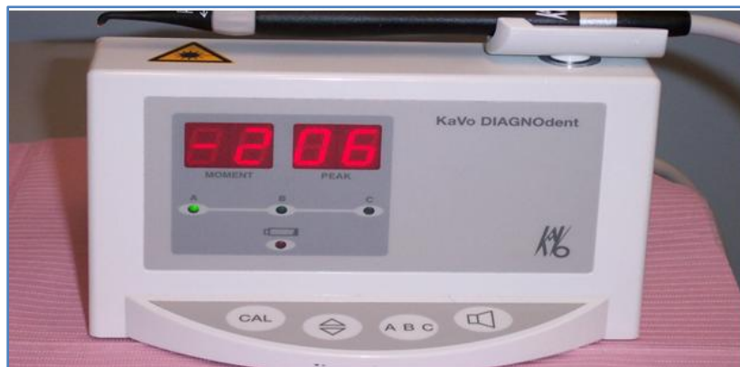
LEGEND 5: Fig. 5: Diagnodent Laser