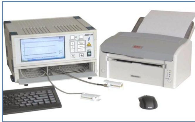
LEGEND 1: Fig. 1: Laser Doppler Flowmetry