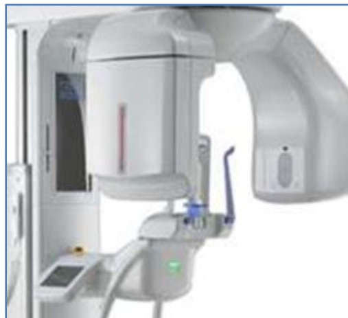
LEGEND 3: Fig. 3: Cone beam computed tomography