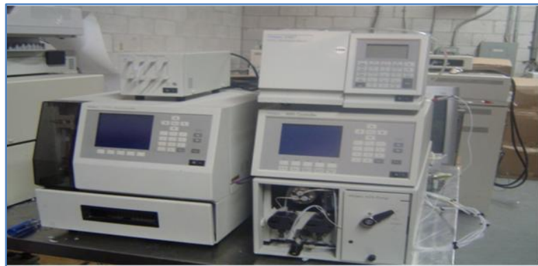
LEGEND 2: Fig. 2: Dual Wave length Spectrophotometry