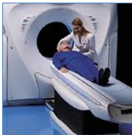
LEGEND 6: Fig. 6: Computed Tomography