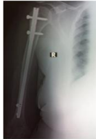
Union at 24 weeks