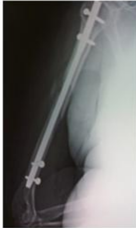
Union at 14 weeks