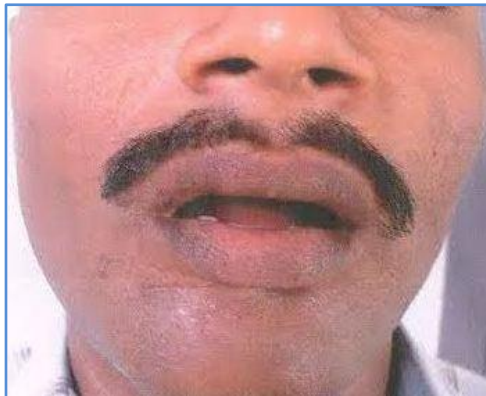
3 months after surgery