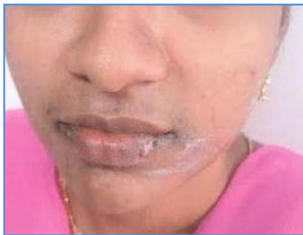
7 days after surgery