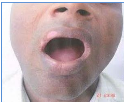
Patient 2 With Split Thickness Grafting