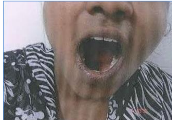
Few months after surgery cobbling at punch grafting site excellent Pigment match at split thickness site