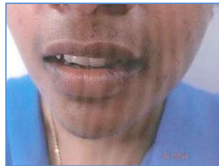
3 months surgery