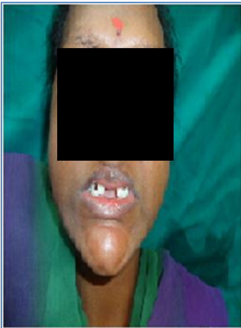
LOSS OF CENTRAL INCISOR