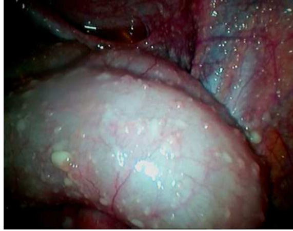
Figure II : Laparoscopy view showing bowel and parietal peritoneum with tubercles