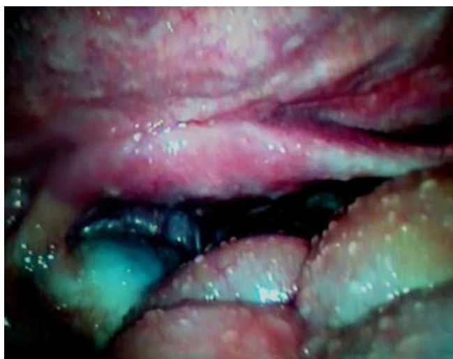
Figure I : Laparoscopy view showing uterus, ovary studded with tubercles