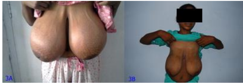
Fig. 3A &amp; B