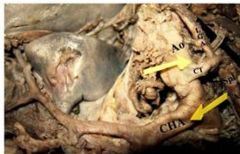
Fig. 3 Lienogastric trunk from coeliac trunk CT - Common Trunk,CHA-Common hepatic artery LGA-left Gastric Artery,SPL - Splenic Artery,Ao-Abdominal aorta