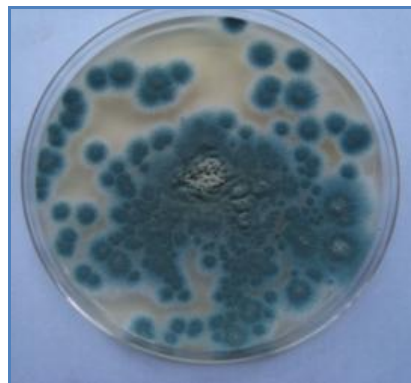
A. FLAVUS COLONY ON SABOURAD'S DEXTROSE AGAR