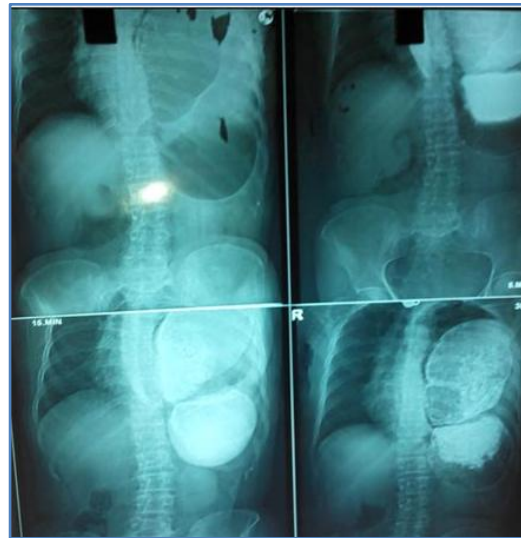
Fig. 2: Barium contrast study showing Gastric Volvulus and Eventration of Left diaphragm