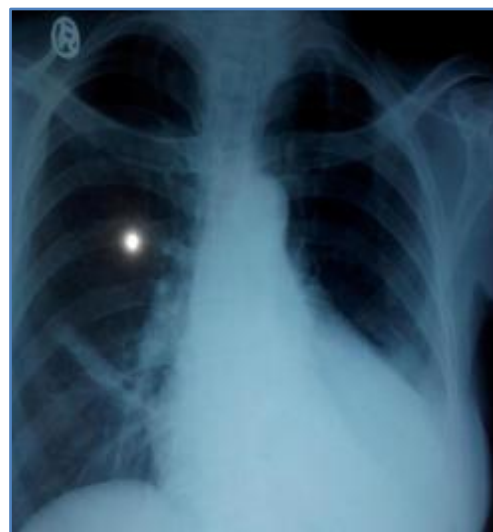
Fig. 4: Post- Operative x-ray chest