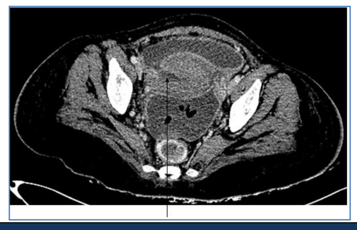
Fig. 1: CT Scan showing Uterine wound disruption