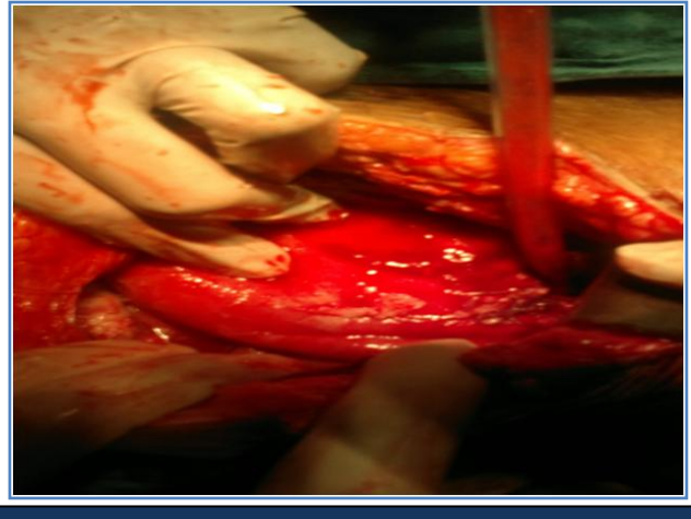
Fig. 3: Picture showing disruption of caesarean scar