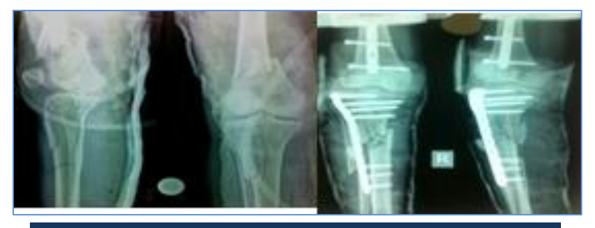
Fig. 2: Pre-operative ILN for femur & Plating for Tibia