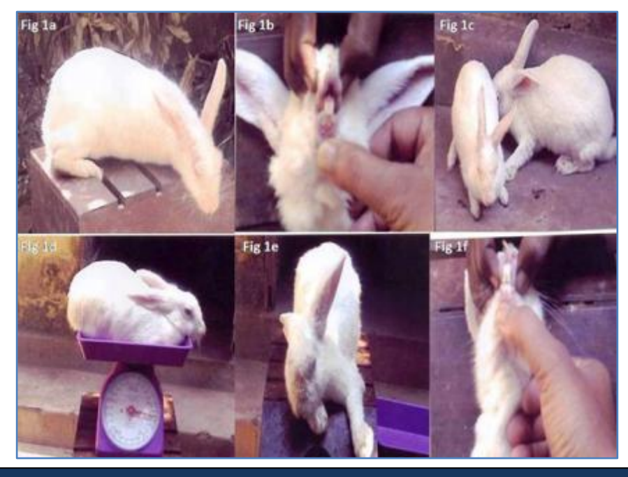
Fig. 1a-f: Different stage of observation after fluoride treatments

Table 1: Histopathological findings of kidney of Group C animal after treating with sodium fluoride solution