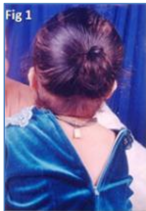
Fig. 1: Down's baby showing broad and short neck, flat occiput and excessive nuchal skin.