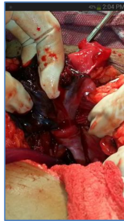
left ovary with torsion and rupture