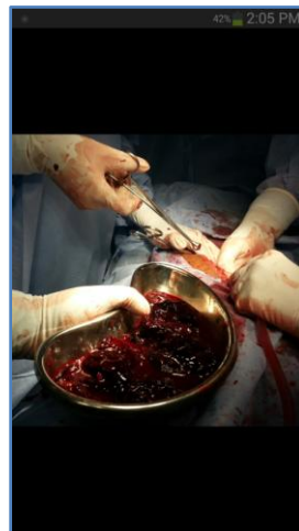
800 gms of clots were present