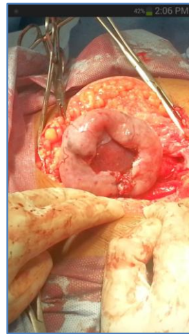
right ovary with multiple cyst after securing hemostasis