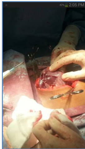
right ovary with multiple cyst with rupture and bleeding