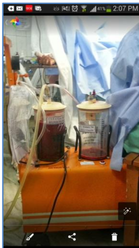
1800 ml of hemo peritoneum