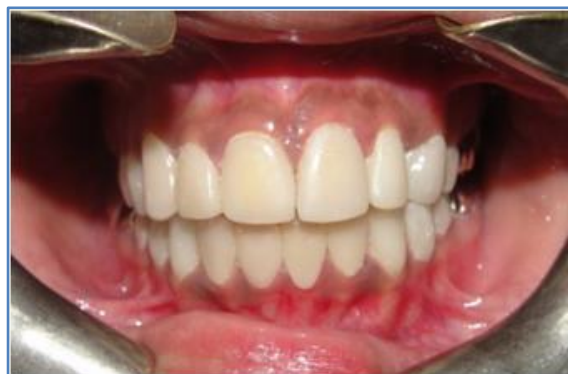
Fig. 15: Cemented restoration frontal view