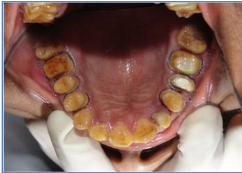
Fig. 5: Maxillary Crown preparation & gingival retraction