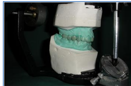
Fig. 4: Diagnostic wax up Right lateral view