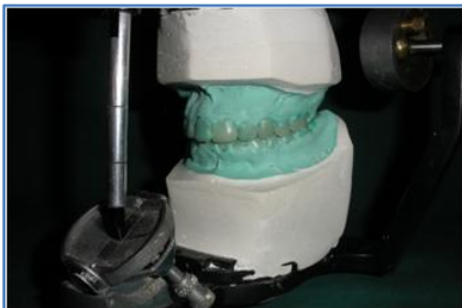
Fig. 3: Diagnostic wax up Left lateral view