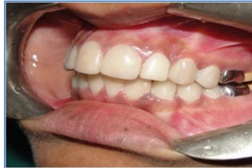
Fig.14: Cemented restoration left lateral view