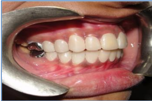
Fig.13: Cemented restoration right lateral view