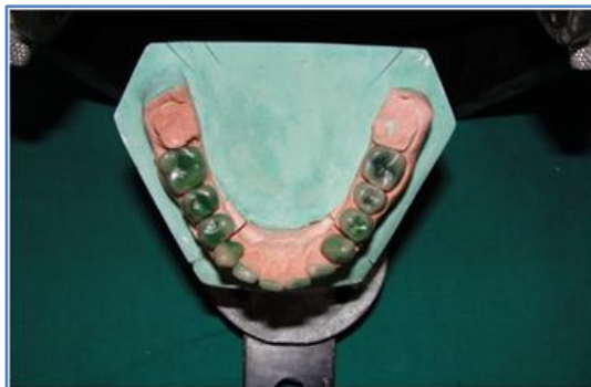
Fig. 9 Wax pattern fabrication Lower occlusal view