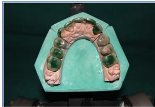
Fig. 8: Wax pattern fabrication upper occlusal view