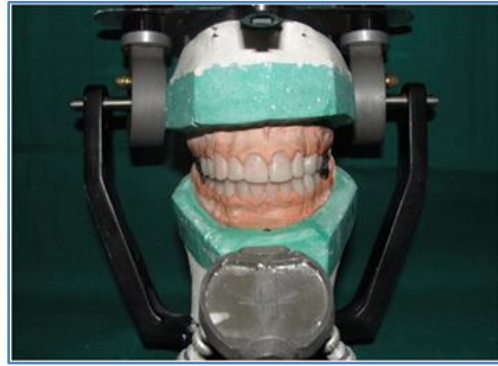
Fig.12: Finished restoration frontal view