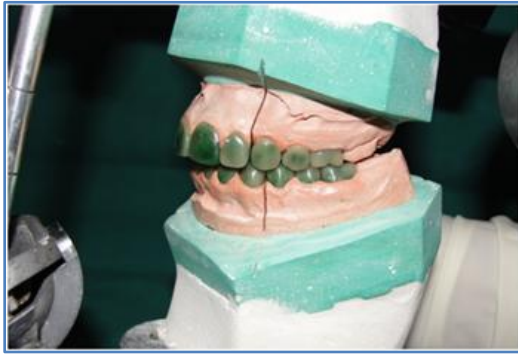
Fig. 11: Wax patterns in centric left lateral view