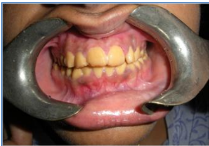
Fig. 1: Pre-operative view