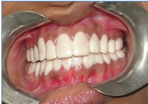
Fig. 7: Provisional restoration