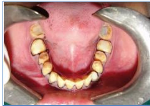
Fig. 6: Mandibular Crown preparation & gingival retraction