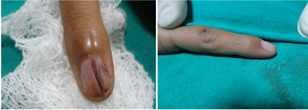
Figure No.1 - 22 year old female showing Figure No. 2 - Lateral View Showing Complete splitting of the Right hand little Swelling at the base of the nail bed Finger nail. of Right hand little finger.