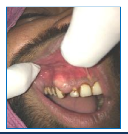
Fig.1: Intraoral view showing a swelling of the buccal gingiva