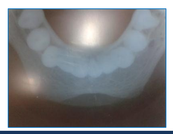
Fig. 2: Occlusal radiograph showing bilateral radiopaque lesion involving the lower border of mandible in parasymphysis region