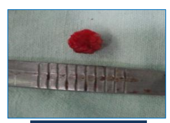
Fig. 6: Excised specimen of 12x 10x 8 mm