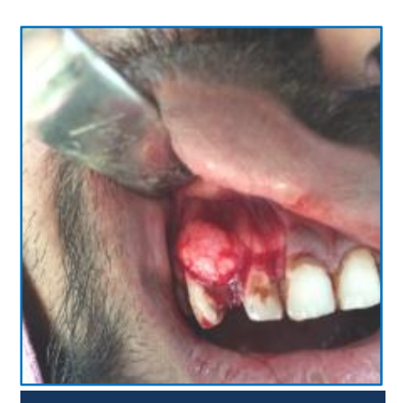
Fig. 2: Surgical exposure of the lesion