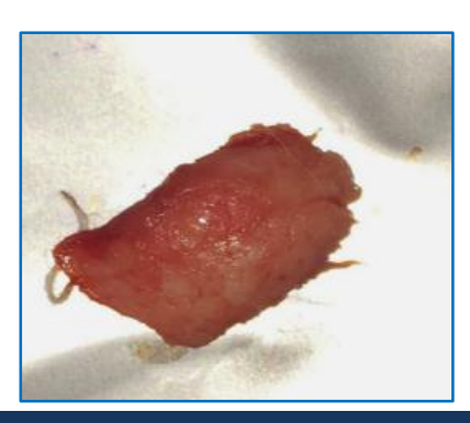
Fig. 3: Surgical specimen consisting of a well-defined, White, smooth mass 18x15x10 mm in size