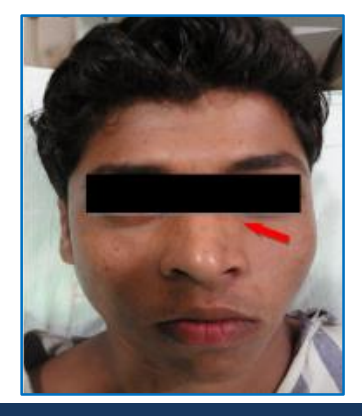
Fig. 1: Pre-operative frontal photograph of the patient with Swelling on the lateral aspect of the bridge of the nose on left