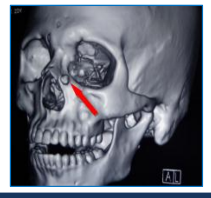
Fig. 2: Three dimensional reconstruction showing well defined, Round radiopacity on the frontal process of maxilla on left side