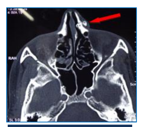
Fig. 3: Axial view of CT scan showing the radiopacity