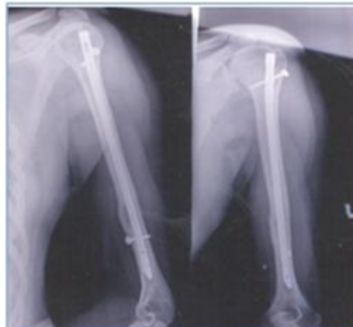
5 MONTHS AFTER THE SURGERY