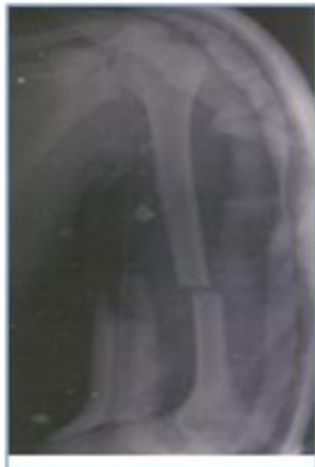
PRE OP FRACTURE SHAFT HUMERUS