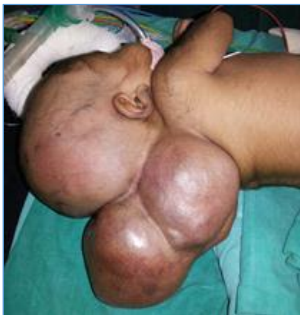
Fig. 3: After Intubation