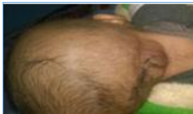
Fig. 4: Followup