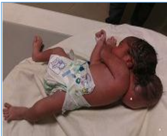
Fig. 1: (Infant at Birth)