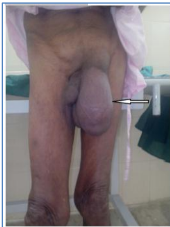
Figure 1: Gaint Left Inguinoscrotal Hernia