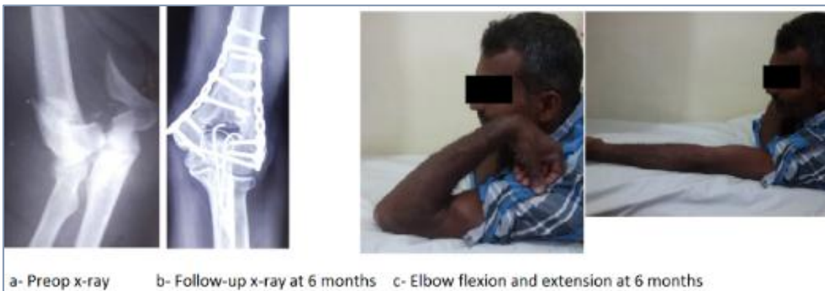
Case 2: a- Preop x-ray, b- Postop x-ray, c- Elbow flexion and extension at 6 months