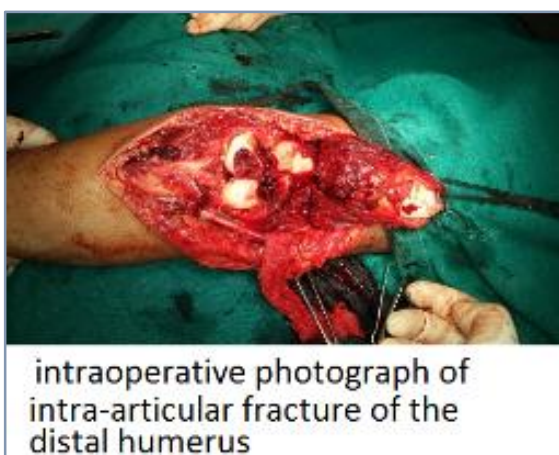
intraoperative photograph of intra-articular fracture of the distal humerus