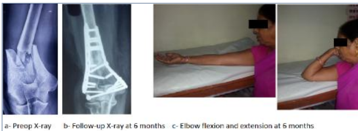
Case 1: a- Preop x-ray, b- Postop x-ray, c- Elbow flexion and extension at 6 months