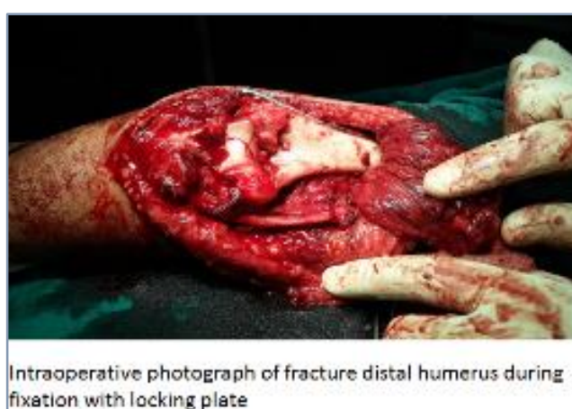
Intraoperative photograph of fracture distal humerus during fixation with locking plate