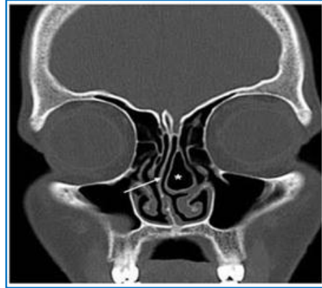
FIGURE 2: CT PNS Coronal section showing left concha bullosa with DNS