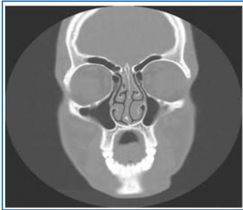
FIGURE 3: CT PNS Coronal section showing paradoxical turn of middle turbinates