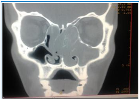
FIGURE 5: CT PNS Axial and Coronal section section left antrochoanal polyp with nasopharyngeal