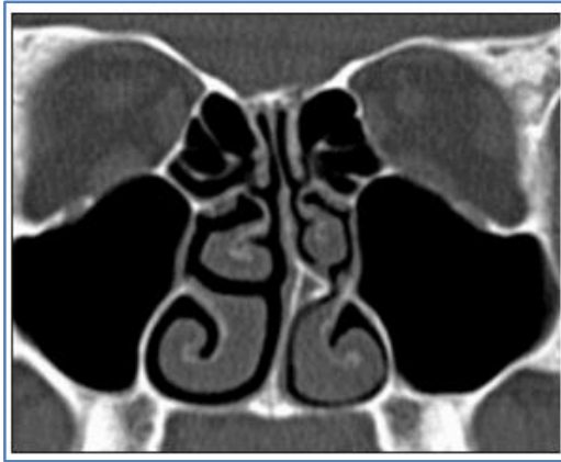
FIGURE 1: CT PNS Coronal section showing deviated nasal septum toward left side