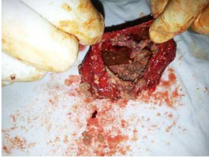
figure 2;cyst cavity from which foul smelling paste like material evacuated