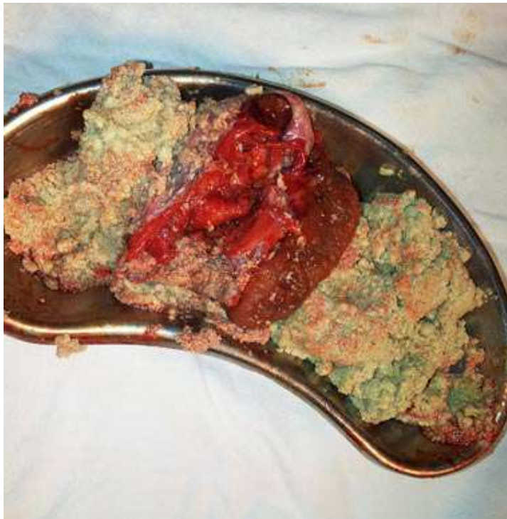
figure 3;completely excised cyst with paste like material