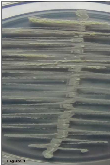
FIGURE 1: Colony morphology of the isolate on CLED agar, after 24 hrs of aerobic incubation at 37 deg C.