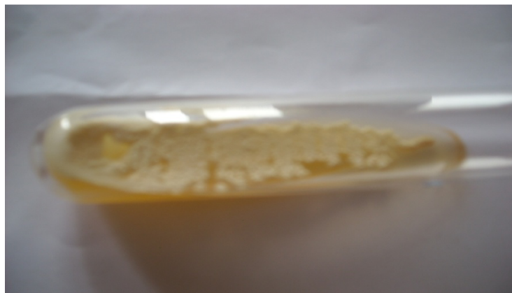
FIGURE 3: Colony morphology on SDA tube after 24 hrs of aerobic incubation at 37 deg C.