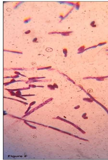
FIGURE 2: Gram stain morphology of the isolate,