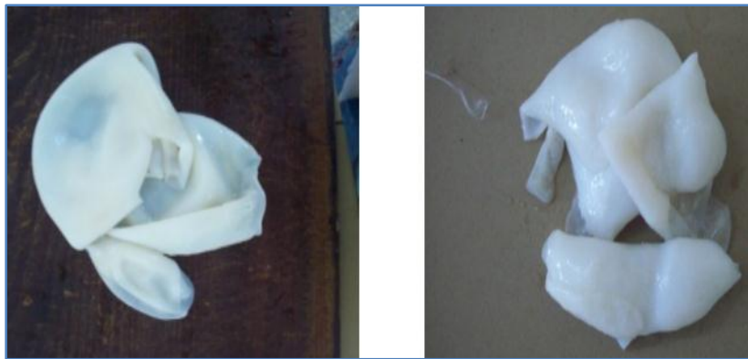
Fig. 1 & 2

Fig. 3: Gross picture showing a part of lung with a cystic cavity containing cyst having pearly glistening white, opaque smooth outer and inner surfaces.