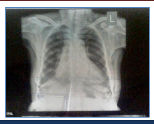
Figure 1: Patient chest X Ray PA view showing dilated Left Atrium and Left Ventricle