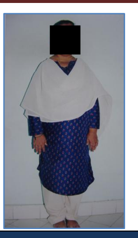
PATIENT WITH OSTEOPETROSIS