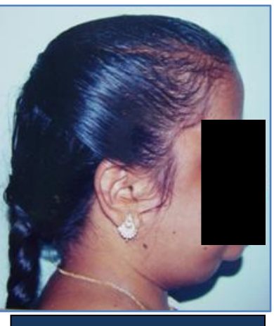
HEAD OF THE PATIENT