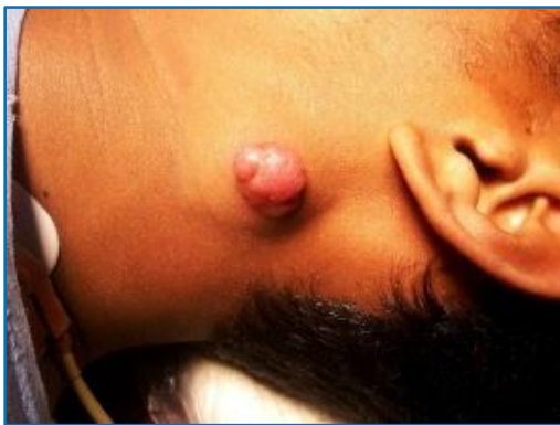
Fig. 2: Pre OP