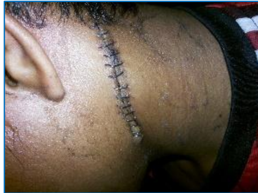
Fig. 3: Post OP