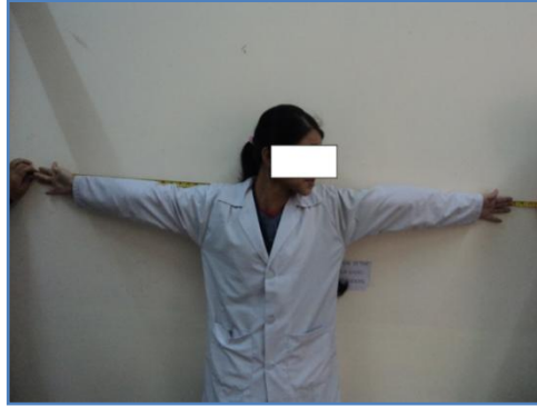
Measurement of arm-span length