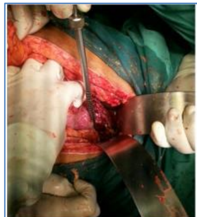
Intraoperative photo showing large gastric perforation

CASE REPORT: Fifty year male presented with complaints of severe epigastric pain, vomiting and distended abdomen of two days duration. He was Haemodynamically stable with generalized guarding and rigidity of abdomen and peristaltic sounds were absent. Erect x-ray of abdomen showed presence of free gas under the right dome of diaphragm and generalized haziness all over abdomen suggestive of perforation of a hollow viscus with peritonitis. Ultrasound examination showed collection of more than 500ml free fluid in the abdominal cavity. All other investigations were within normal limits except for a marked polymorphonuclear leukocytosis. Patient was subjected to an exploratory laparotomy by an