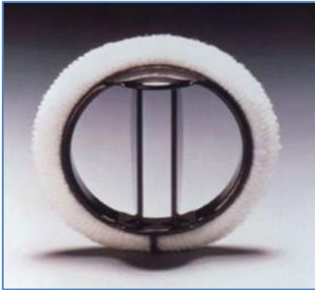
St JUDE MECHANICAL VALVE