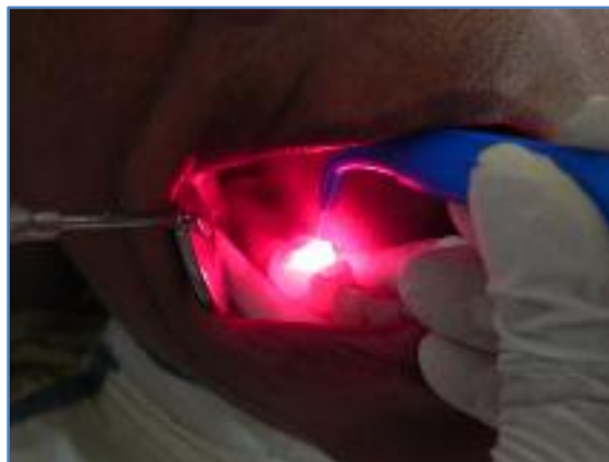
Fig. 2: Laser application