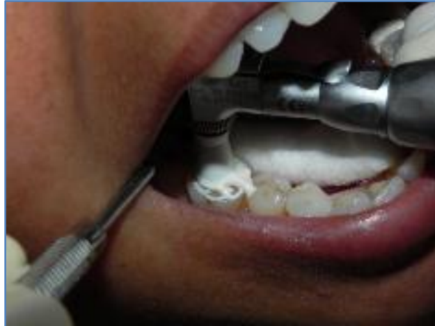
Fig. 3: Application of the test paste