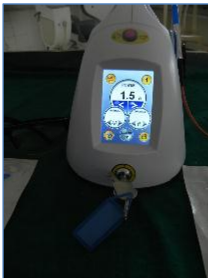
Fig. 1: Diode laser (AMD, Picasso Diode, Indianapolis, Indiana)