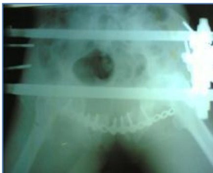
External Fixator with Recon plating