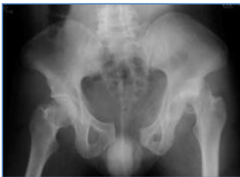
Pre - Op X-ray