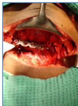
Intra - Op