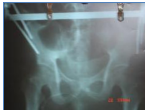
Post - Op X-ray