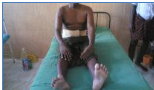
6 weeks Post-op