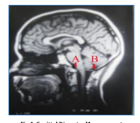
Fig.1: Sagittal Diameter Measurement of Foramen Magnum in MRI.

Personal data of the patients was recorded. During the MRI scan, the brain, spinal cord, and CVJ region were thoroughly examined to rule out pathology. The sagittal diameter of foramen magnum was measured directly in the mid sagittal MRI image obtained on the monitor during the scan. The measurements were automatically recorded by controls on the operator's console. Basion and Ophisthion were marked 'A' and 'B' respectively (Figure 1). The sagittal diameter of the foramen magnum was equal to the distance between 'A' and 'B'. The bones were easily identified by their low signal intensity. The data was analysed using the computer package SPSS/PC.