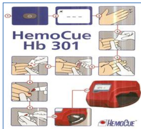
Fig.1: The Hemo Cue Method